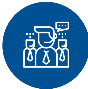
Customer Service Attention and Customer Support.